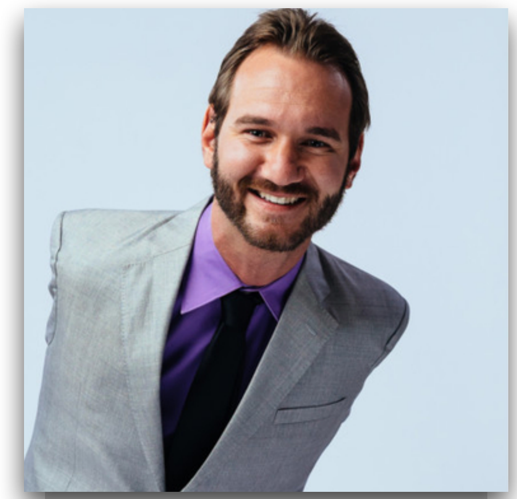
Nick Vujicic U.S.

Prominent Social Entrepreneur, Founder of the 77 th Street